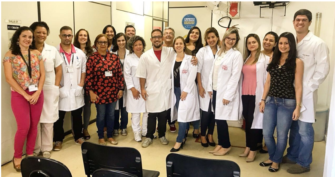
The HGNI Team (some important member of the team are not present)

The HGNI HIV Family Care Clinic #31927 , based in Rio de Janeiro, Brazil, has enrolled 77 participants in the 30 weeks that they have been activated! They shared how they achieve strong enrollment in REPRIEVE: