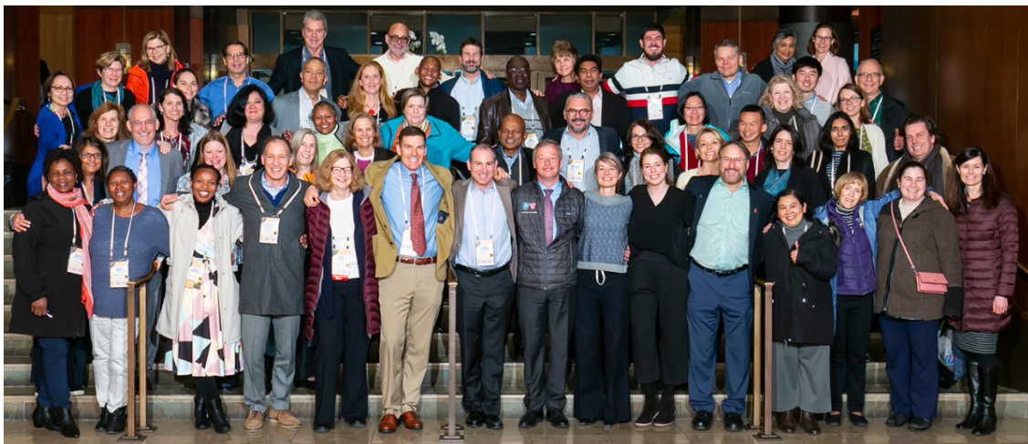
REPRIEVE Investigator's Meeting 2019 Seattle, WA

Randomization will be closed after March 24th. Please make ALL efforts to enroll participants by this date as there will be no exceptions after this time.