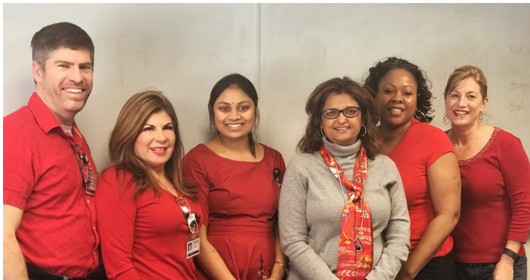
The UT Southwestern REPRIEVE Team in their Go Red For Women Day attire for Heart Month