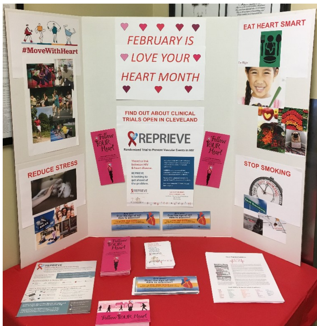
Case CRS's Heart Health Awareness table in the John T. Carey Special Immunology Unit waiting